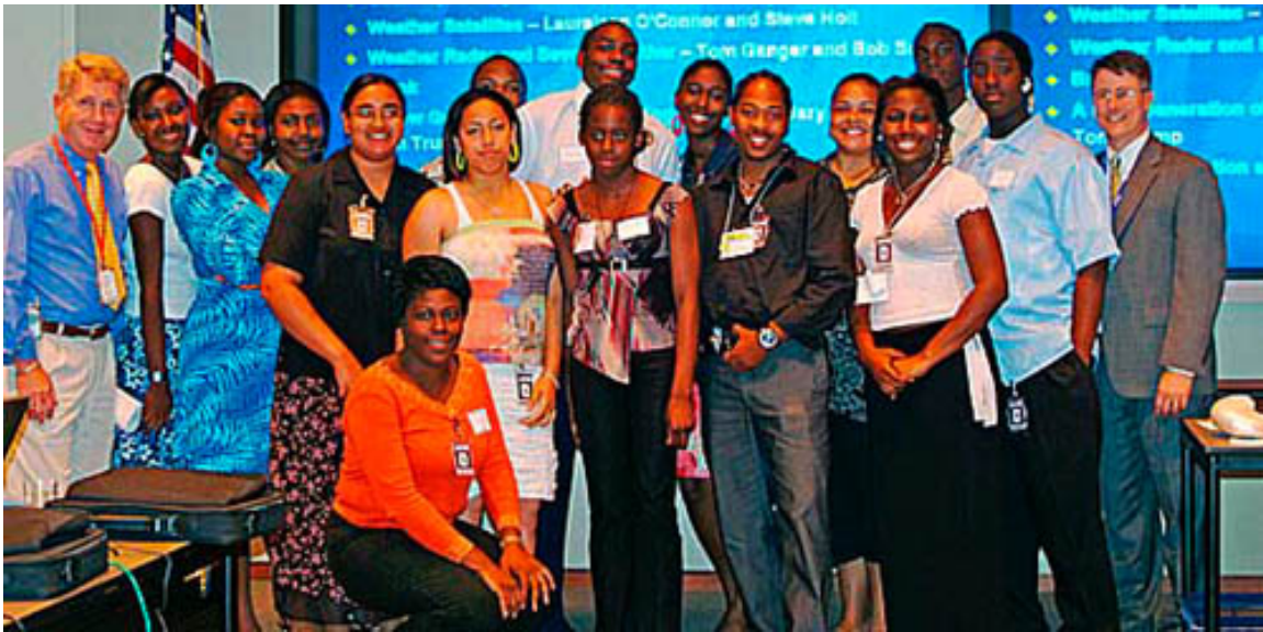
Fourteen high school students from Maryland, Virginia, and D.C. attended Weather Camp 2004, funded by NOAA.

Fourteen minority high school students from eight high schools in Maryland, Virginia, and Washington, DC attended a NOAA-funded camp for students who want to increase their knowledge of meteorology, weather, science and technology this summer. Weather Camp 2004, co-sponsored by Mitretek Corporation and coordinated by Howard University provide top-performing students a glimpse of meteorological and ocean sciences work and to encourage them to consider these career fields. Campers learned about work of the National Weather Service, as well as overviews of work with geostationary and polar orbiting satellites, Doppler radar technology, ocean exploration work with remotely operated vehicles and autonomous underwater vehicles and talks providing information on exciting careers in science and engineering.